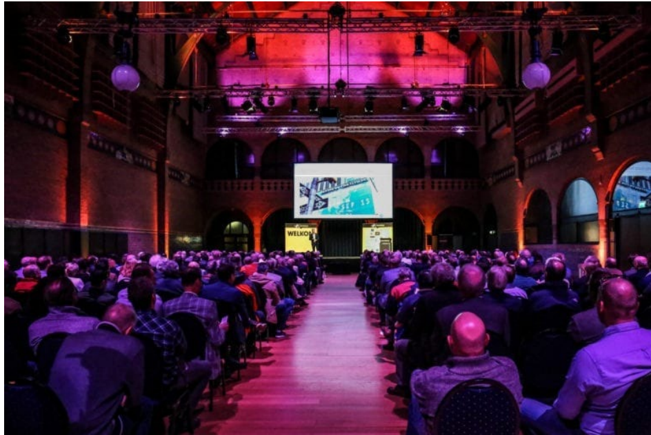
The Effectenbeurszaal – location of the Plenary and Technical sessions