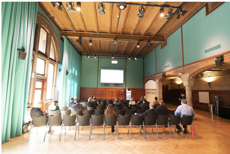
The Administratiezaal – location of Technical Sessions (the Veilingzaal is nearly similar)