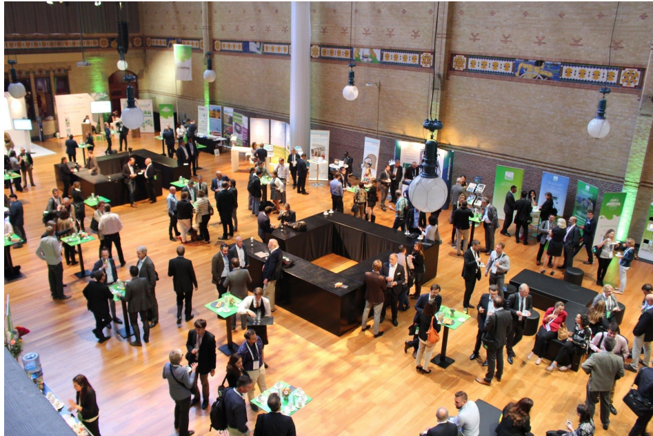
The Graanbeurszaal – location of the exhibition