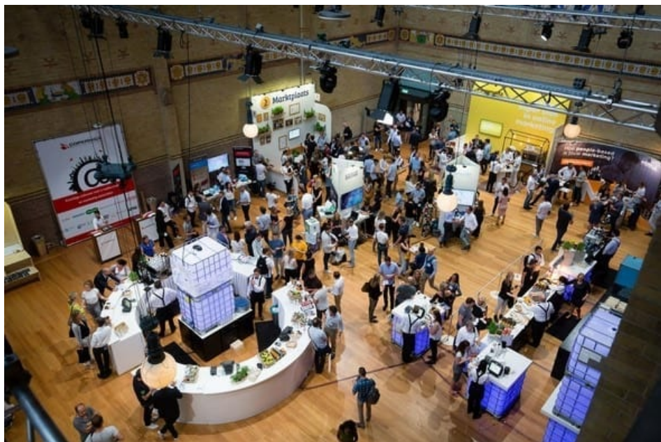
The Graanbeurszaal – location of the exhibition