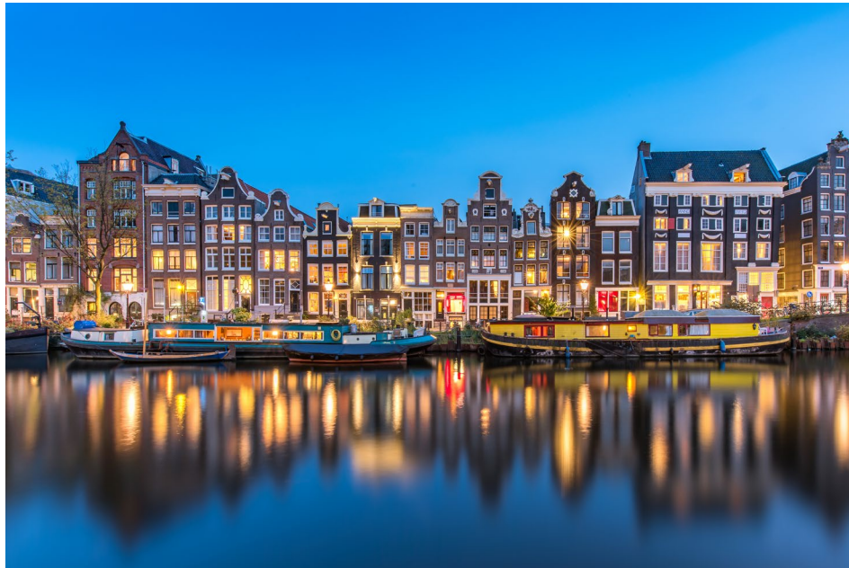
Amsterdam, city of art, science and innovation!