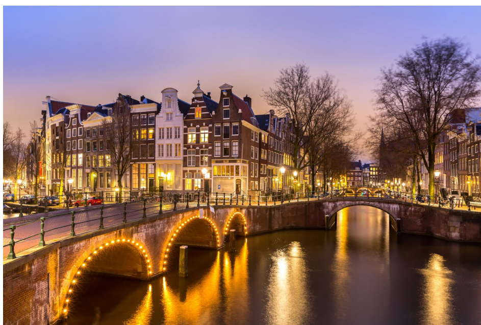
Enjoy the world-famous canals of Amsterdam!