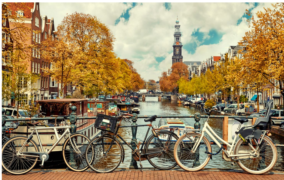
Amsterdam, one of the world's best touristic destinations!