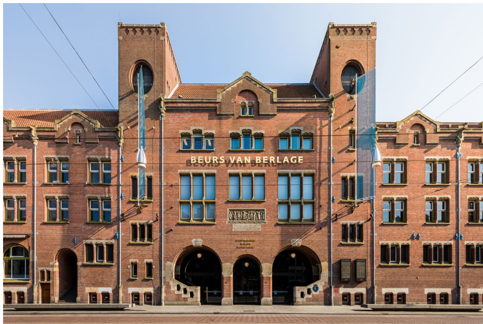
The Beurs van Berlage, in the heart of Amsterdam