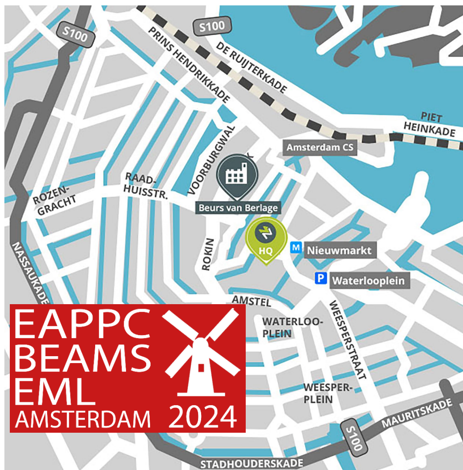
“The Beurs van Berlage venue – located in the heart of Amsterdam”

EAPPC-BEAMS-EML 2024 will be held at the ‘de Beurs van Berlage Conference Centre’, located in the heart of Amsterdam . Amsterdam is the Netherlands' capital, known for its artistic heritage, elaborate canal system and narrow houses with gabled facades, legacies of the city's 17 th -century Golden Age. Amsterdam has everything international conferences are looking for: great infrastructure, history, culture and multilingual population. It combines the friendliness and accessibility of a historic village with the world-class facilities and cultural attractions of a modern metropolis.