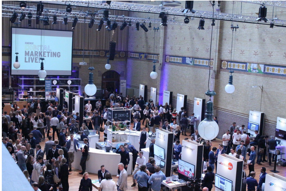
The Graanbeurszaal – location of the exhibition