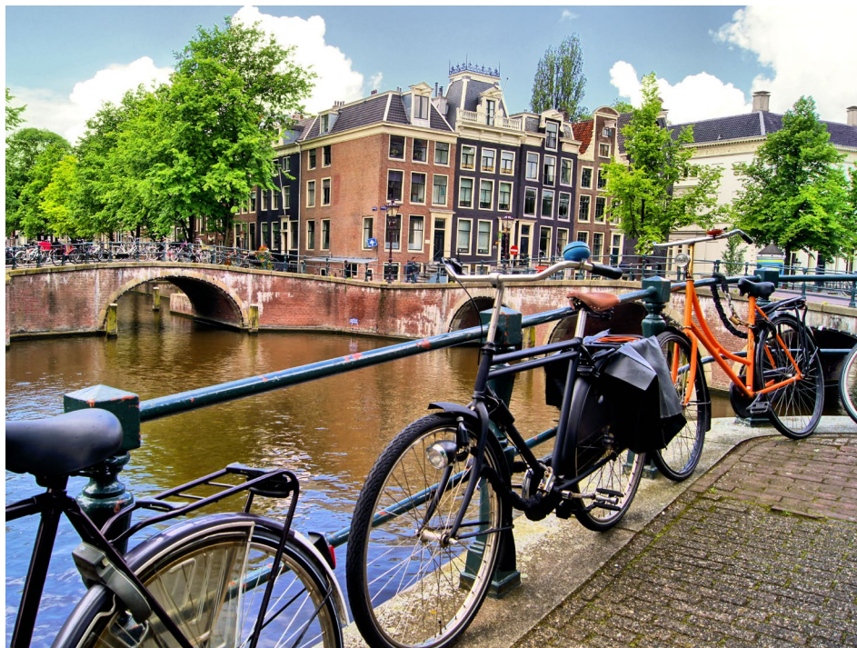
Rent a bike in beautiful Amsterdam!

Enjoy the pictures and impressions of this beautiful city and perfect conference location. Watch the Amsterdam city movie: https://youtu.be/ycLFcMUd64U