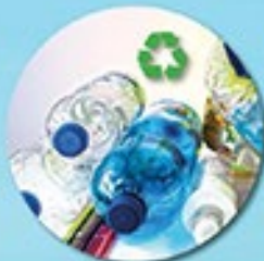
Recycled Materials: Characterization & Detection of Contaminants