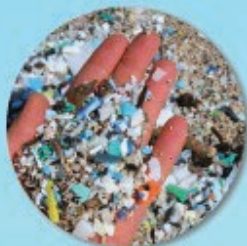
Micro- and Nano Plastics: Identification and Quantification