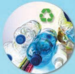
Recycled Materials: Characterization & Detection of Contaminants