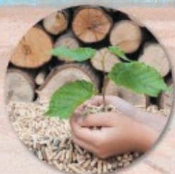
Renewable Energy: Biomass and Catalysts