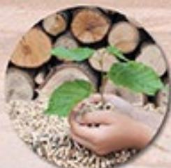
Renewable Energy: Biomass and Catalysts