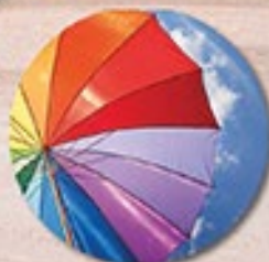
Aging and Stability: Degradation and Deterioration