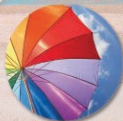
Aging and Stability: Degradation and Deterioration