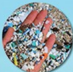
Micro- and Nano Plastics: Identification and Quantification