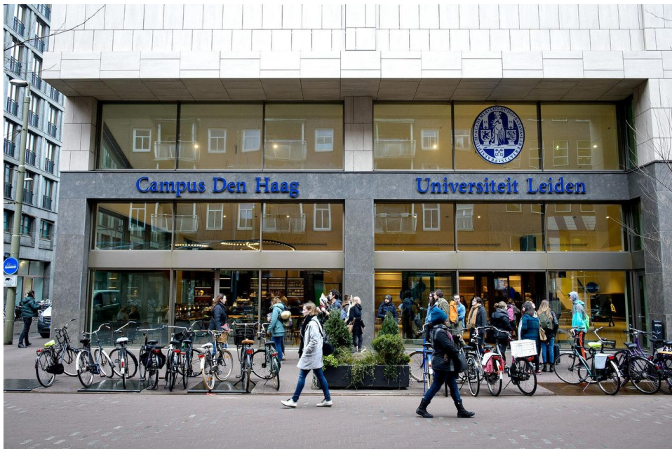
Facade of entrance to university campus building

The Labs are located on the 5th floor. Please follow 'TU Delft' signposts.